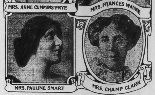
Chaperons for the winners of the big beauty contest on their trip to San Francisco exposition, San Diego exposition and Universal City.

Somewhere in Georgia there is a eager young girl who is soon to be known as the "happiest girl in the country"—the winner of The Constitution-Universal's beauty contest.