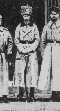
ROME OFFICIALLY ANNOUNCES THAT THE INVASION HAS BEEN EXTENDED OVER ALMOST WHOLE OF AUSTRO-ITALIAN FRONTIER.

London, May 26.—The king of Italy has taken supreme command of the army and navy, and is now with his troops on the frontier of the Austro-Italian territory, and for a few miles in Austrian territory, the Italian lines stretch for a distance of fifty miles.