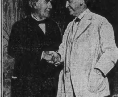
THOMAS A. EDISON AND SECRETARY DANIELS.

"I believe that when we have assembled the inventive genius of this nation we shall be in a state of defense such as no other nation has ever known."