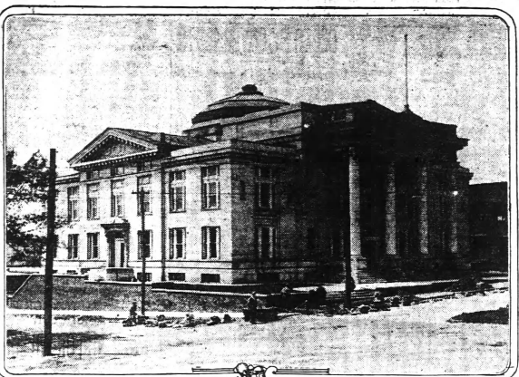
Spalding county's courthouse, for fireproof construction. Court will convene there next week.