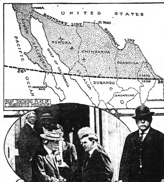
MAP SHOWING PLAN OF SUGGESTED MEDIATION. The map shows the proposed boundaries for states in Mexico, including Sonora, Chihuahua, Durango, Coahuila, Tamaulipas, Nuevo Leon, and San Luis Potosi.