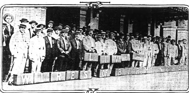
The "Live Wires" of the big Alabama city came to the Gate City Tuesday on a visit to the Atlanta Rotary club, one of the most recent organizations of this city...