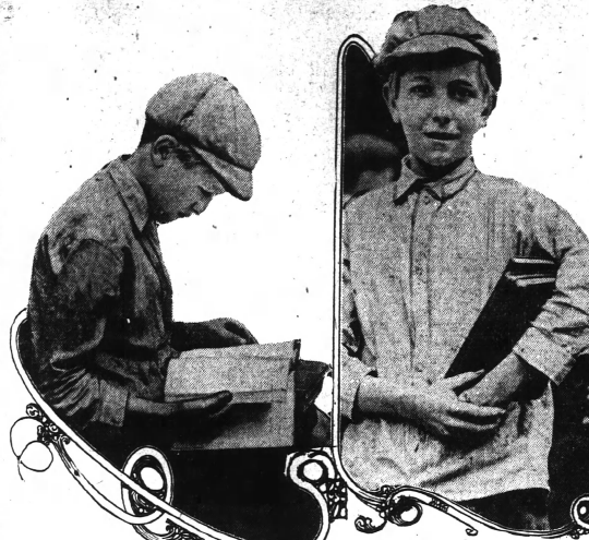
Scenes common in Atlanta on first day of school, when eager youngsters rushed home after visit to book stores to have a look at their new text books.

More than 500 teachers were at their respective points, ready to welcome the happy youngsters who began schooling in at 8:30 o'clock. The classes were quickly formed, and the preliminary work was well under way shortly after the children were seated. The giving out of book lists and lesson assignments was rushed through as speedily as possible, and in less than two hours the army of children were on their way to the shopping district to make their purchases.