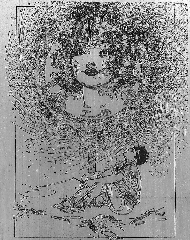
In the golden-flamed center of the gorgeous Catherine wheel he seems to see a lovely face with eyes that are for him only, surrounded by a radiance that dims the glow of the finest pyrotechnical display ever shown.