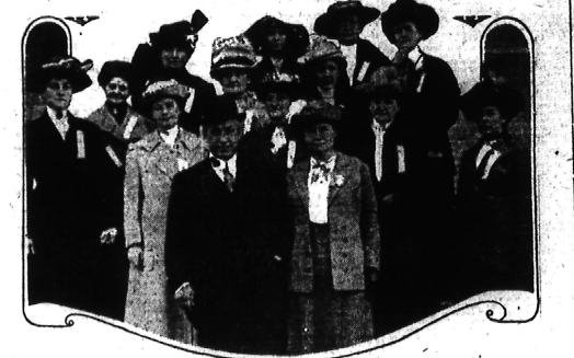
These are the first women in America to serve as deputies during election law. They stood all day May 20...