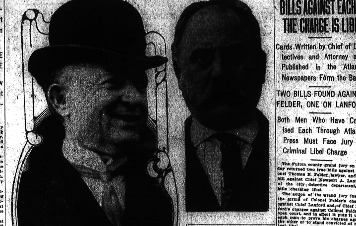
Portrait of a man, likely related to the news stories.

Three Atlanta policemen were indicted today for patronizing blind tigers.