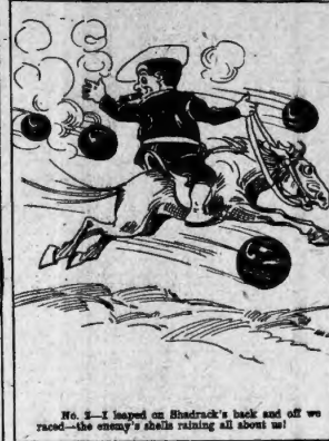
No. 2—I leaped on Shadrack's back and off we raced—the enemy's shells raining all about us!