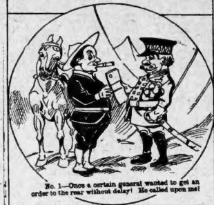
No. 1—Once a certain general wanted to get all order to the rear without delay? He called upon us!