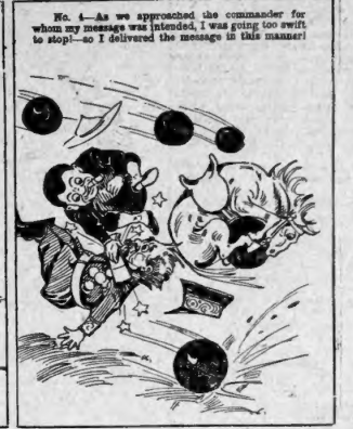
No. 4—As we approached the commander for whom my message was intended, I was going too swift to stop—so I delivered the message in this manner!