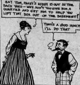
OLD NICODEMUS NIMBLE