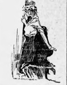
Every Drop Seemed to Fall With Cold Finality on Her Heart.

It was not the loss of the clothes or of the vacation itself for which Sarah was grieving; it was for the fact that