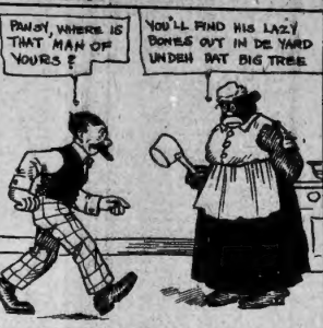
AT THE FRONT