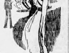
"They All Eye Mark."

"Dear lamb," Sarah thought, as she returned to the little, lonely house, "I'll have to excuse my not going to Cousin Eleanor's some way. It will trouble her,