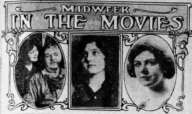
THEY ARE THREE GREAT FAVORITES. Left to right, Marguerite Clark, in "The Pretty Sister of Jose," Alamo No. 2, Friday; Anna Little, in "A Social Lion," Alpha, Thursday; Gail Kane, in "Her Great Match," Strand, Wednesday and Thursday.