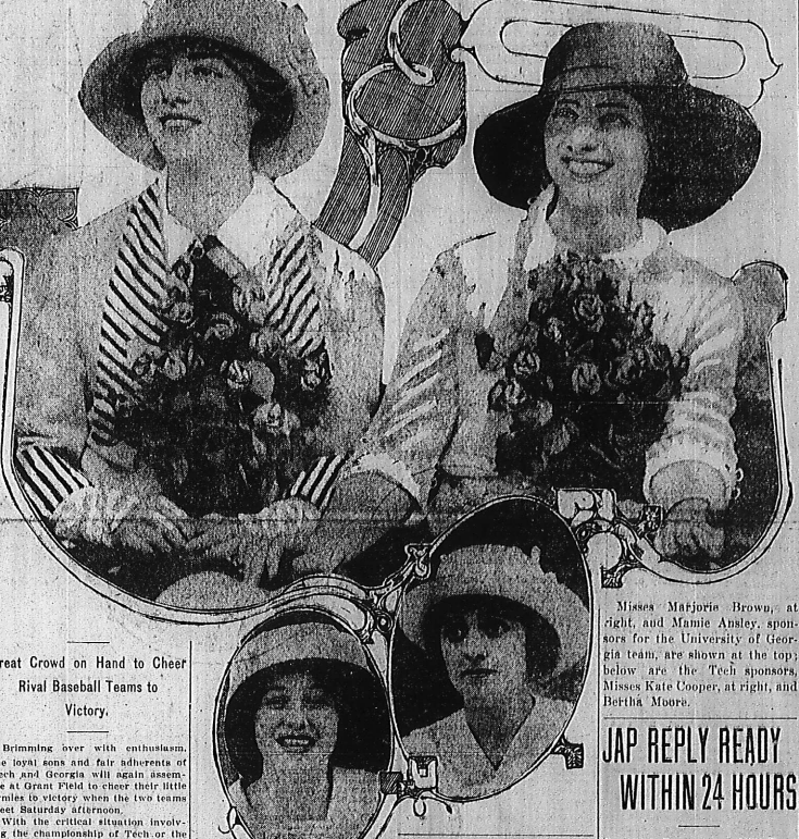
Great Crowd on Hand to Cheer Rival Baseball Teams to Victory.

Brimming over with enthusiasm, the loyal sons and fair admirers of Tech and Georgia will again assemble at Grand Field to cheer their little armies to victory when the two teams meet Saturday afternoon.