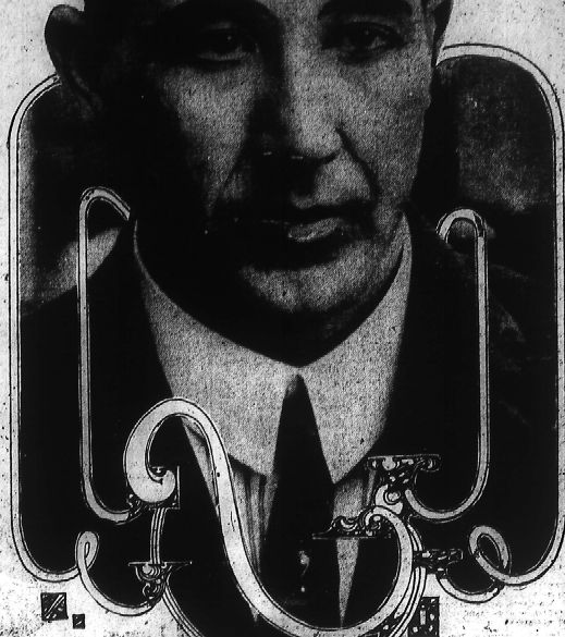
Who was arrested at Marietta and brought to Atlanta Monday, charged with the death of Mary Phagan.